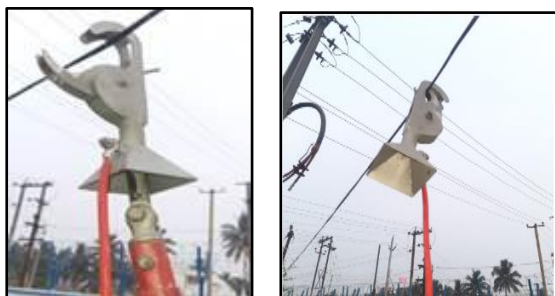
Discharge Clamps with One Discharge Rod