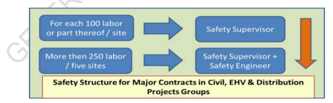
Annexure 3.6 (Refer Para 4.0)