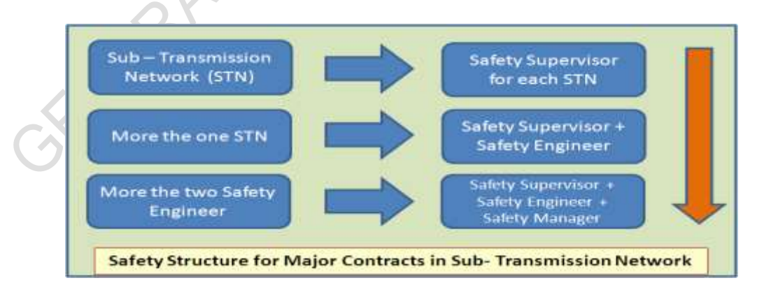
Annexure 3.5 (Refer Para 4.0)